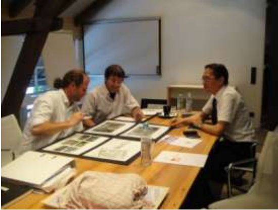
A meeting in Munich (Germany) between FIAM and Interactive TV Association (ITVA) to develop the international network with German speaking regions on multimedia and internet. television. (May)