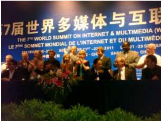
Signing ceremony on international team for the project of home video games from China. (September)