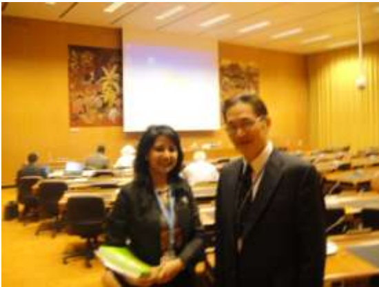
Participating in the World Summit on Information Society (WSIS 2011) in Geneva, hosted by ITU, UNESCO, UNCTAD and UNDP. (May)