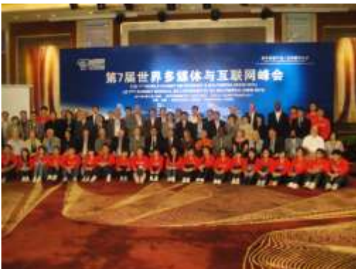
The 7 th World Summit on Internet and Multimedia (WSIM 2011), hosted by FIAM; supported by the Creative Economy and Industries Programme of UNCTAD, International Organization of la Feancophonie (OIF) and World China Network Association (WCNA); organized by Shenyang (Qipanshan) National Cultural Industry Demonstration Zone, Shenyang International Chamber of Commerce. (September)