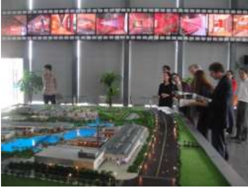
Visiting China (Wuxi) National Digital Film Industry Park. (September)

A meeting in Shanghai between FIAM and Shanghai Multimedia Industry Association (SMIA). (September)