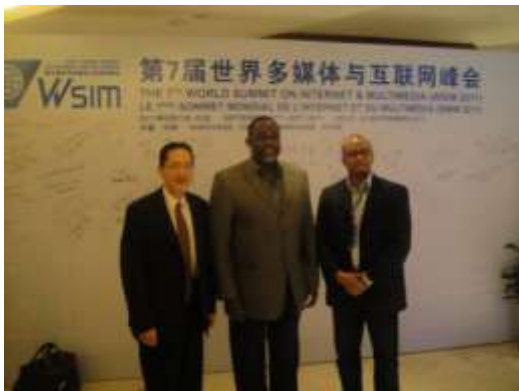
A cooperation with Commonwealth Telecommunication Organization (CTO) to develop the international network with Africa in multimedia and internet. (September)