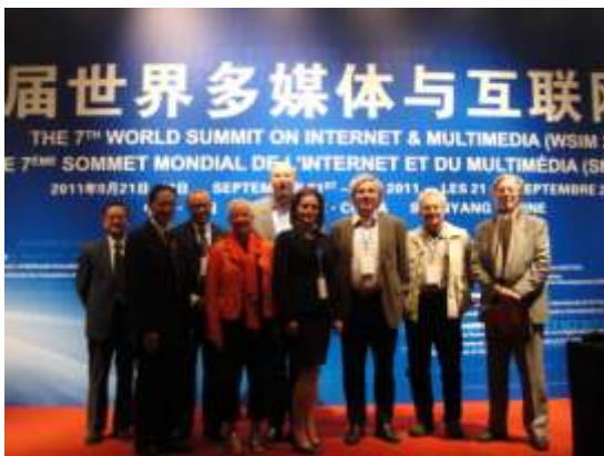
FIAM's international team from French speaking regions. (September)