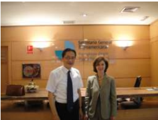
A meeting in Madrid (Spain) between Iberamerican Secretariat and FIAM to establishing an international network with Spanish and Portuguese speaking regions on multimedia and internet. (May)