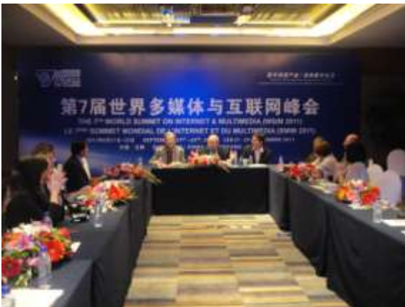
FIAM Awards 2011 (International Digital Arts Awards). (September)