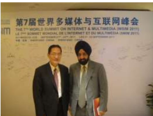
A discussion with Global Digital Business Association (GDBA) and Faculty of Business and Economics, University of the South Pacific (USP) from Fiji for the international network development with the region of Pacific Ocean in digital communication and management. (September)