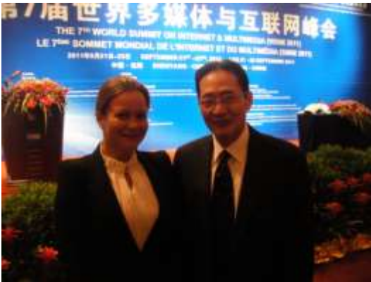
A discussion with the Russian participate to facilitate the international network with Russia in digital media industry, during the period of WSIM2011. (September)