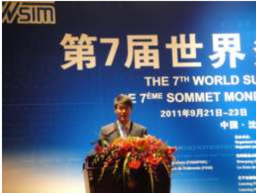
FIAM's network with International Society for Digital Earth (ISDE) in digital earth. (September)