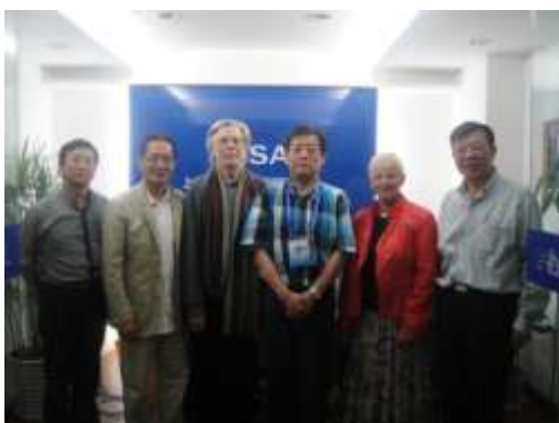
Signing the MOU on mobile internet and e-health in Shanghai between FIAM and Shanghai Information Services Association (SISA). (September)