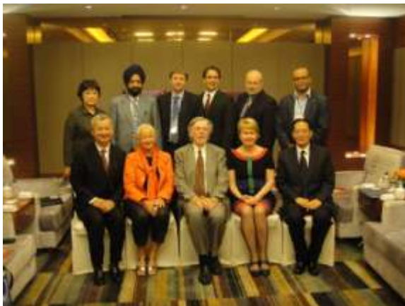
FIAM board meeting. (September)