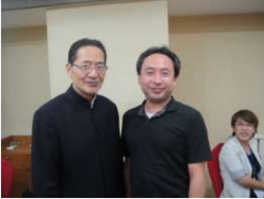
A discussion with the official representative from the City of Kumamoto (Japan) to promote the international network with Japan in digital management and digital life. (September)