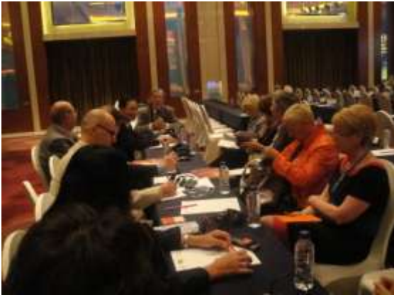
The annual meeting of FIAM International Advisory Committee. (September)