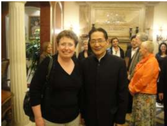
FIAM's network with the Division of Technology, Industry and Economics (DTIE), United Nations Environment Programme (UNEP) on green electronic and digital wastes. (September)