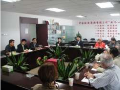
A meeting in Beijing between the FIAM Team and China Animation Group Co. Lit. to explore the international opportunities with China in home video games. (September)