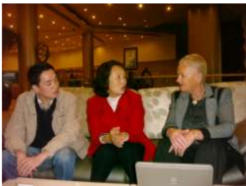
A meeting in e-health and e-pharmacy between Digital University of Pharmacy Science in French Speaking Regions (USPF), FIAM and Shanghai Digital Health Centre. (November)