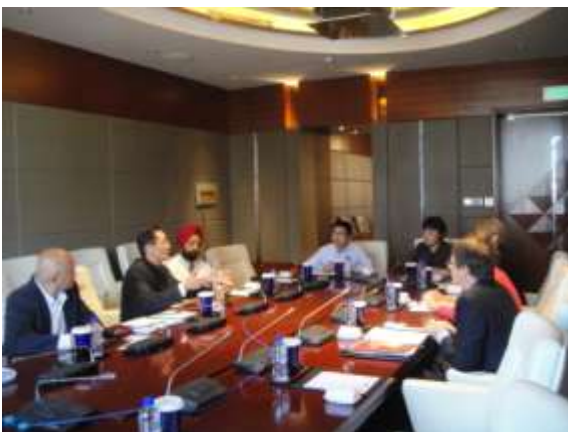
Establishing the Asia-Pacific Centre of FIAM. The participants are from China, Russia, Japan, Australia, Fiji, Canada, etc. (September)