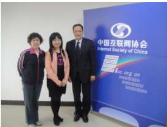
A meeting on internet in Beijing between FIAM and Internet Society of China. (April)