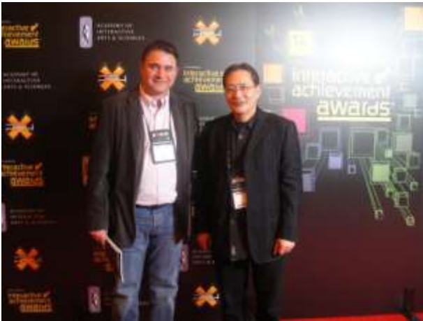
A discussion with the Mexican game developer of KaxanGames for international opportunities with Mexico in interactive game, during the period of the DICE Summit. (February)