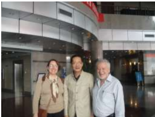
A discussion with Federal University of Latin American Integration (UNILA) / Federal University of Rio Grand do Sul (UFRGS) from Brazil and University of Buenos Aires from Argentina for the international network with Latin America in social media. (September)