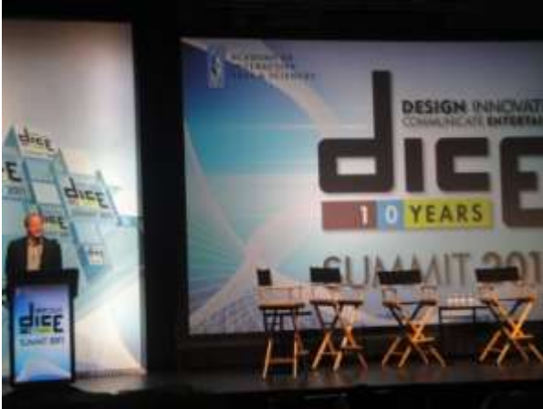
Attending the DICE Summit 2011 (Design, Innovate, Communicate, Entertain), hosted by Academy of Interactive Arts & Sciences (AIAS) in Las Vegas. (February)