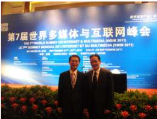
A discussion with the Songpa-gu District, Seoul Metropolitan Government (Korea) in digital city development. (September)